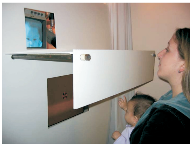
Figure 2. Forced-choice preferential looking (FPL) technique used in the current study. On each trial, the grating stimulus appears on the left or right side of the display and an adult experimenter uses the infant's head-turning and eye gaze behavior (viewed with a video camera aimed at the infant's face, projected onto the camera monitor above) to judge the stimulus location. Note that the adult experimenter is blind to the stimulus location, because a piece of cardboard blocks her view of the video monitor. Above chance (i.e., >50% correct) performance indicates an ability of the infant to detect the stimulus.

These FPL studies yielded performance data that went from 50% to 100% correct as a function of increasing contrast. To obtain luminance and chromatic contrast thresholds, for each infant, psychometric curves were fit to the data points (separately for chromatic and luminance data) using Weibull functions and maximum likelihood analysis (60,61), and contrast threshold was